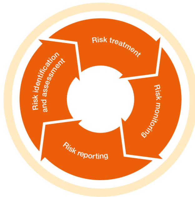
Fig. 3 (HM Government, The Orange Book, Management of Risk – Principles and Concepts , 2020)

Whilst the risk management process is represented as sequential, it may in practice be iterative.